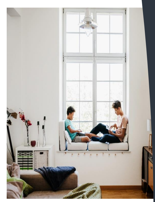
CONSULTING PROVIDES A TOTAL END TO END SOLUTION.

Once the contract made, Zeali sends the service provider on a required basis with certain interval according to the above package details for performing the necessary activities. All the services will be performed on scheduled basis according to customer convenient timing. The service providers will be arranged within 12 hrs. for emergency services. In case of any issues created by service provider, Zeali will take a required action on them and arrange new vendor on immediate basis.